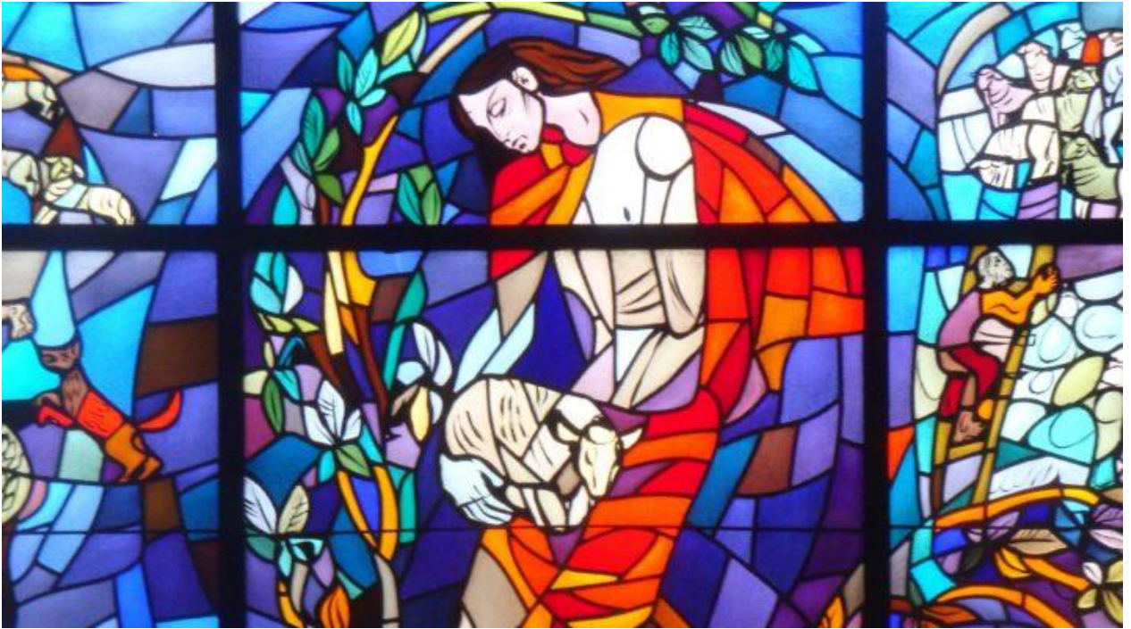
Image credit: Stained glass window from Church of Our Lady of Perpetual Help in Tarnobrzeg-Serbinów, Poland.