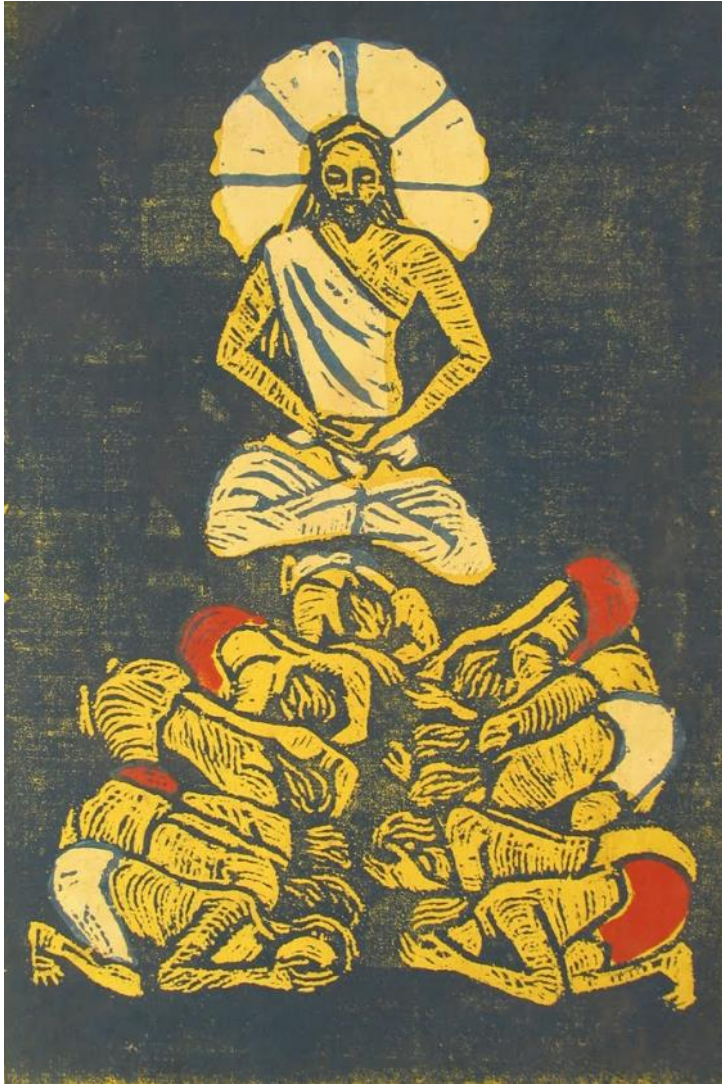
Jesus Ascended on the 'Lotus Throne' (India art)

Sixth Sunday of Easter ~ Sunday, May 17, 2020 ~ Ascension Sunday